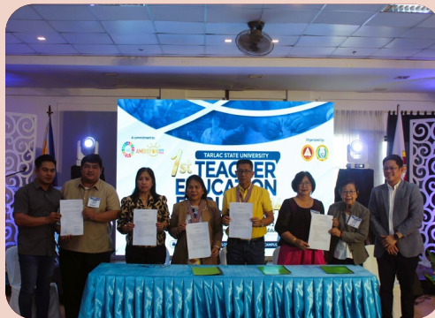
TSU CoEd spearheads 1st Teacher Education Forum