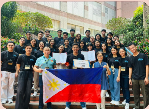
TSU Chorale returns to Taiwan competition with gold awards